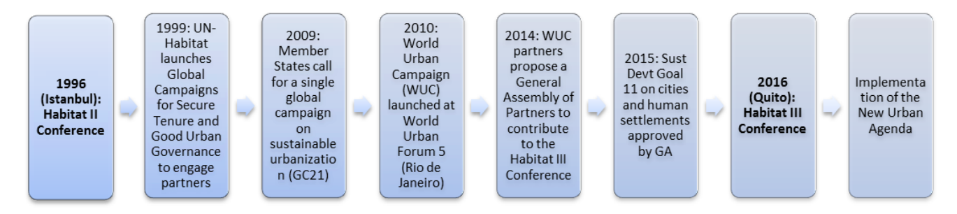
Figure 3: Origin and evolution of the World Urban Campaign

Urban Campaign, in supporting and improving stakeholders' engagement in and contributions to the preparatory process for Habitat III and the Conference itself', 70.