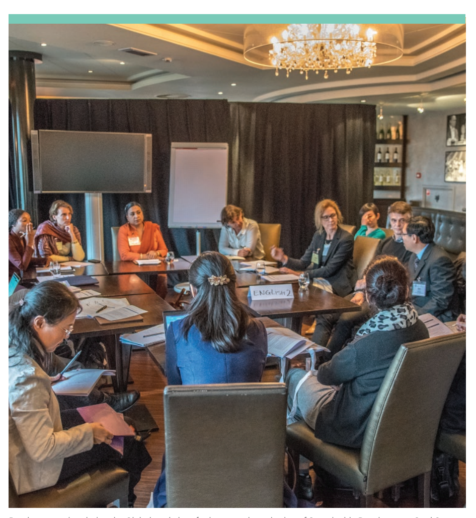
Break out session during the Global workshop for integrated monitoring of Sustainable Development Goal 6 on water and sanitation, the Netherlands, November 2017.

The 2017 integrated baseline process allowed for capacity building for both personnel and programmes. In terms of personnel, an important objective was establishing contact points in countries, both for each of the indicators and for the overall process. To that end, many conversations happened over the year with Member States, including continuous bilateral conversations with overall focal points in the 30 countries participating in the integrated process. The Global Workshop for Integrated Monitoring of SDG 6 on Water and Sanitation, which took place in November (see below)