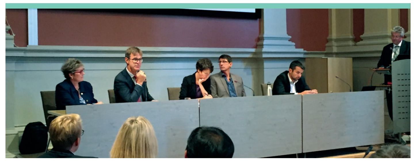
Coordination of SDG 6 Implementation: Where do we stand? How can we do better?" during 27th UN-Water Meeting, Sweden, August 2017

The interviews, as well as country posters produced for the Global Workshop on Monitoring SDG 6 in November, provide good examples on how countries are implementing SDG 6 monitoring. In addition to the Integrated Monitoring Guide, postcards and information sheets for the indicators were developed and printed.