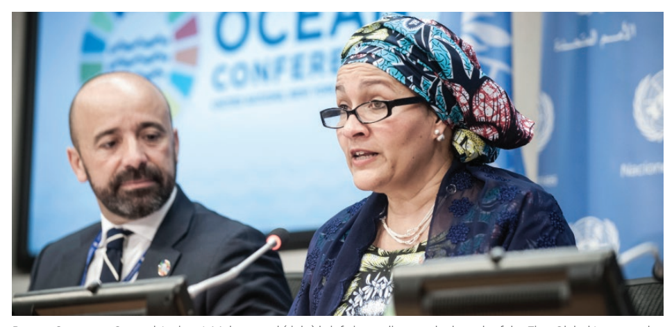
Deputy Secretary-General Amina J. Mohammed (right) briefs journalists on the launch of the First Global Integrated Marine Assessment, also known as the first "World Ocean Assessment".

The high-level UN Conference to Support the Implementation of Sustainable Development Goal 14: Conserve and