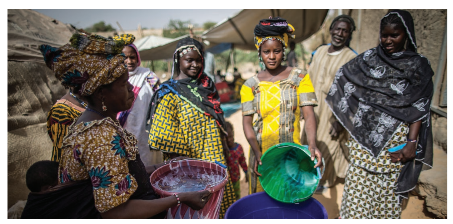
The United Nations Multidimensional Integrated Stabilization Mission in Mali (MINUSMA) completed a community project bringing water to the small villages of Kabara and Tarabangou, near to the city of Timbuktu in northern Mali.

which means working across traditional portfolios and sectors. In addition, it is necessary to look at current funding and ensure the best possible use of every investment. During Stockholm World Water Week, UN-Water participated in the discussion "Accelerating actions for Water & Disasters in the next Decade - with a special focus on investment and financing for water-related disasters", where a set of Proposed Principles on Investment and Financing for Water-related Disaster Risk Reduction was developed. Late in 2017, UN-Water provided coordinated input to "Financing for Development: Progress and Prospects 2018" by drawing on the expertise and experience of several key Members. In addition to providing analysis for the report, Members participated in a technical meeting of the report task force held at UN Headquarters in December.