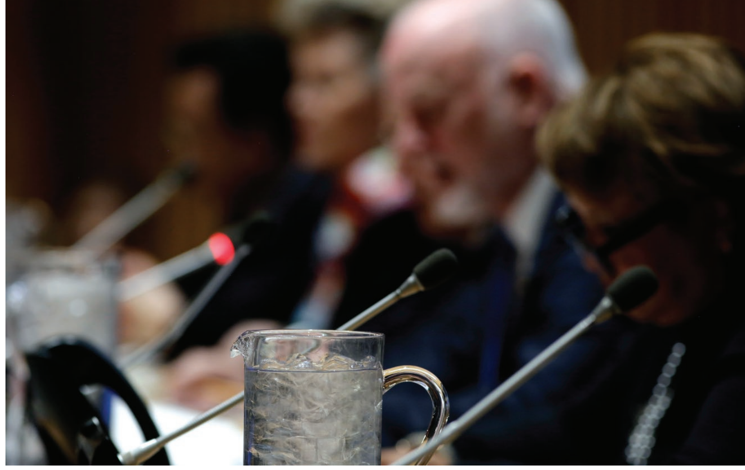
The General Assembly holds a working-level dialogue to discuss improving the integration and coordination of the work of the United Nations on the water-related goals and targets under its sustainable development pillar, with a particular emphasis on the 2030 Agenda for Sustainable Development.

Responsibility for water and sanitation is shared throughout the UN system. Unlike for food, agriculture or health, there is not a principle "go to" entity for water. There are good reasons why water and sanitation reside in many UN entities, however it means coordination that strives to increase synergies, reduce overlap and avoid duplication is critical.