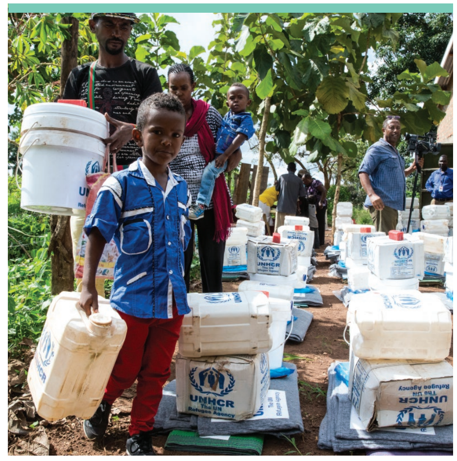
Foreign Asylum Seekers Arrive in Makpandu, Western Equatoria State.

Water supported this effort by providing a compilation of existing research, vulnerable areas and recommendations on water, peace and migration. The compilation showed that water issues are linked with migration and displacement in a multitude of ways: through chronic and sudden environmental change, in direct and indirect ways, and with varying impact throughout the migration process. UN-Water's contribution was the basis for the Panel's recommendation on water, peace, forced displacement and refugees. The World Water Data Initiative is another element of the Panel's work that UN-Water contributed to through sharing the experience of the Integrated Monitoring Initiative at key sessions.