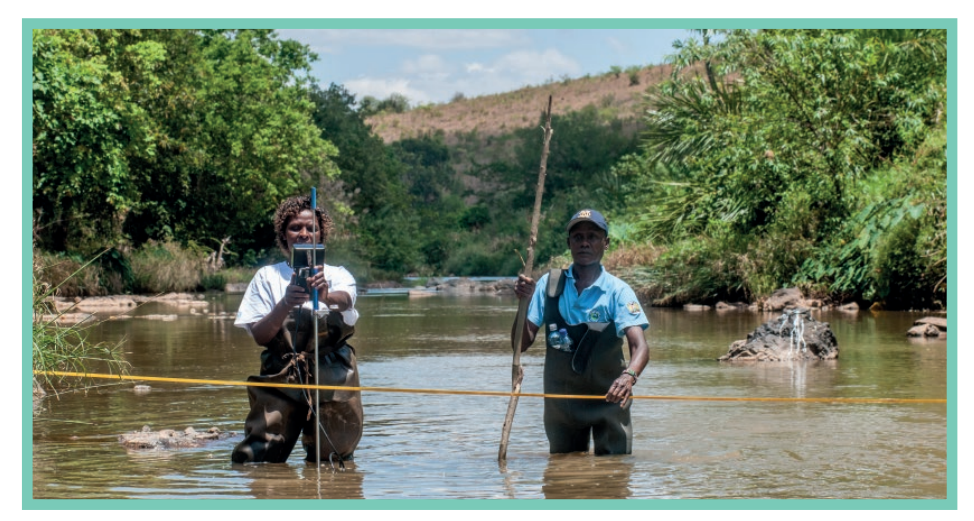
Water sampling in Kenya

Further defining its mandate to coordinate the work of the UN on water and sanitation, UN-Water seeks to be a rational and effective structure to: (1) inform policy processes and address emerging issues, (2) support monitoring and reporting on water and sanitation, and (3) build knowledge and inspire action. Taking the opportunity of two annual meetings, Members also streamlined UN-Water's internal governance including Expert Groups and Task Forces that bring substantive focus and intellectual capital on water and sanitation to the UN system.