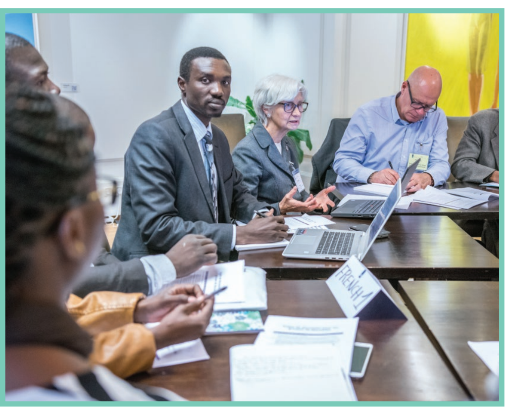
The global workshop on SDG 6 monitoring took place in November in The Haag, Netherlands.