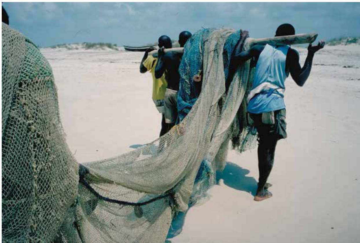
Fishermen carry nets back to their village in Mucoroge, Mozambique.

Meanwhile, an inter-agency Task Team on Urban Risk Management and Climate-smart Cities, organized under the auspices of the United Nations High-level Committee on Programmes' Working Group on Climate Change, has begun to map tools and formulate a "One UN" approach to building urban resilience and fostering climate-smart cities.