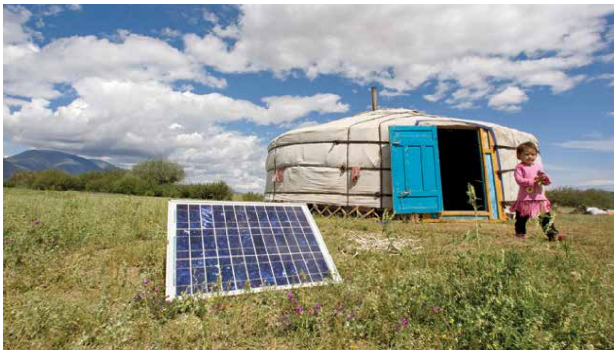
A family in Tarialan, Uvs Province, Mongolia, uses a solar panel to generate power for their ger, a traditional Mongolian tent.

Drawing on the best available science, Governments have recognized that the average global temperature must rise by no more than 2°C above pre-industrial levels if dangerous climate change is to be avoided. This can be achieved if global emissions peak within the coming decade and then decline until there are no new net emissions as early as possible in the second half of the century. Ambitious action is needed, and it is needed now. Fortunately, there are at least three good reasons to have confidence in our ability to meet the challenge: