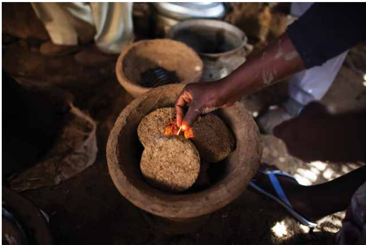
A woman fires a fuel-efficient stove made in the Rwanda camp for internally displaced people in North Darfur. Thousands of women at the camp are the beneficiaries of the Safe Access to Firewood and Alternative Energy (SAFE) project, run by WFP.