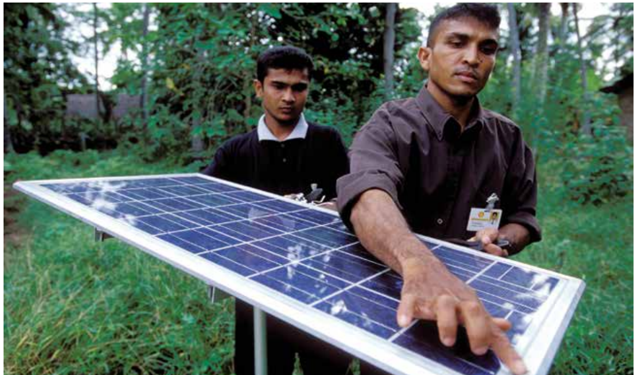
Solar panel used for lighting village houses, Sri Lanka.