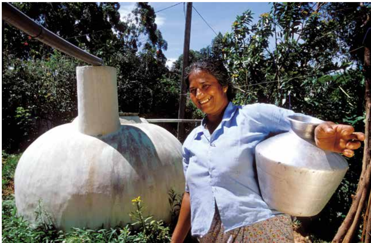
Woman with water jug next to rain water collection tank, Sri Lanka.

in biomass. Protecting or replanting mangroves can reduce the impacts of increased flooding and storm surges.