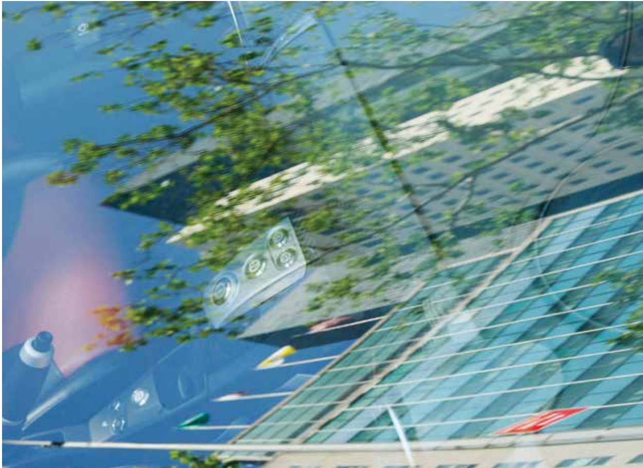
Reflection of the United Nations Headquarters building seen from the windshield of one of the electric cars parked at the UN.