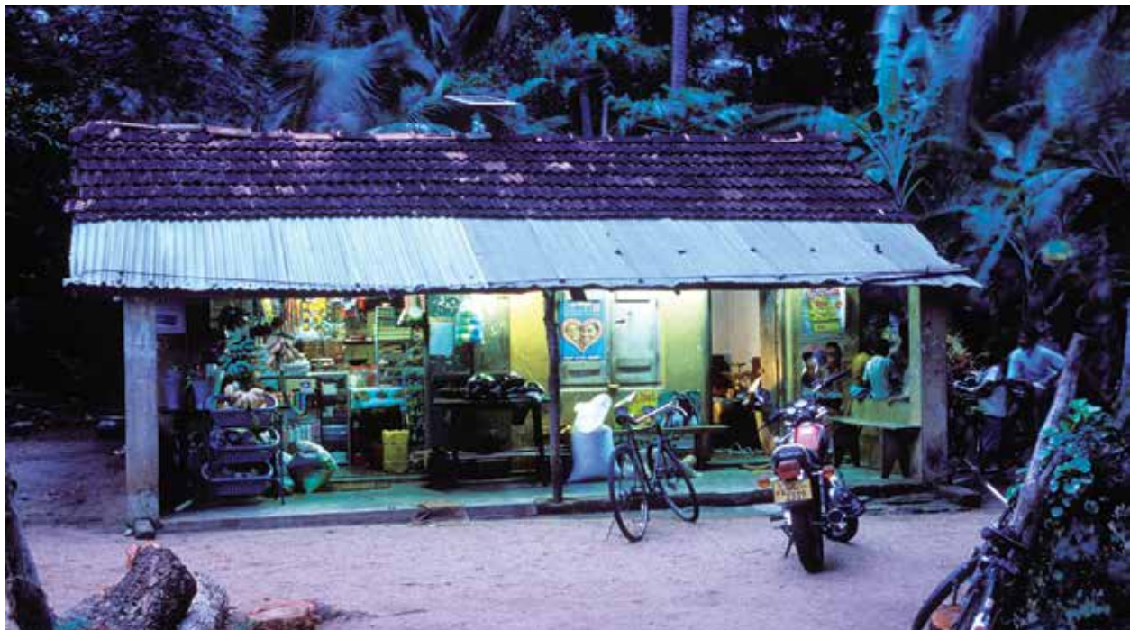
A village shop in Sri Lanka at dusk lit by solar lamps.

Coal, oil and gas have fuelled the world's industrialization and contributed enormously to economic development and human well-being. As a result, however, energy-related carbon dioxide (CO 2 ) emissions currently account for some two thirds of global GHG emissions. As the global economy expands, the total amount of CO 2 emitted by the energy sector continues to rise.