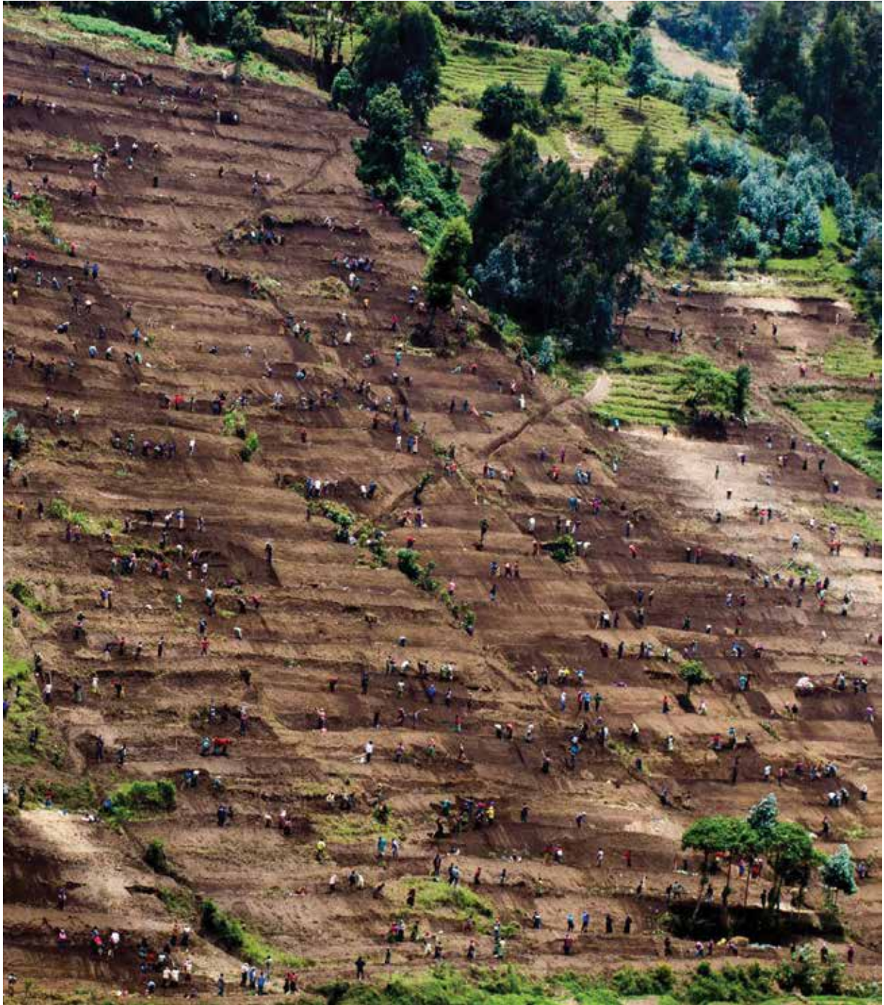
Local community members participating in construction of graded terraces to control soil erosion in Nyabihu District, Rwanda.

Agencies such as WMO, the World Health Organization, FAO, WFP, the Intergovernmental Oceanographic Commission of UNESCO and the United Nations Office for Disaster-risk Reduction have built partnerships to bring historical disaster-risk data together with climate and