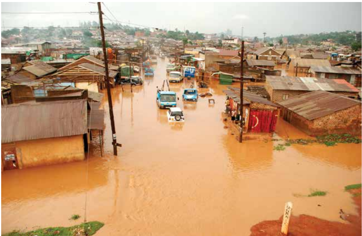
Flooding in Kawerle, Kampala.

UN-Habitat is working with ICLEI Local Governments for Sustainability to promote a low-carbon transition for cities in emerging economies. The partners are working with selected local